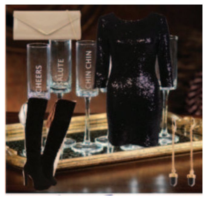
From Left Clockwise- ALDO Gallington clutch $35 aldoshoes. com; Black Bodycon Dress in Sequin $40 missrebel.co.uk; Vince Camuto Pendant Drop Earrings $28 vincecamuto.com; Suede Thigh Boots $44 storenvy.com

What would New Year's Eve be without sequin, glitter, and all that sparkles? A long sleeved sequin body-con dress, thigh high boots, and a pair of simple yet sassy drop earrings makes a badass party outfit sure to wow!