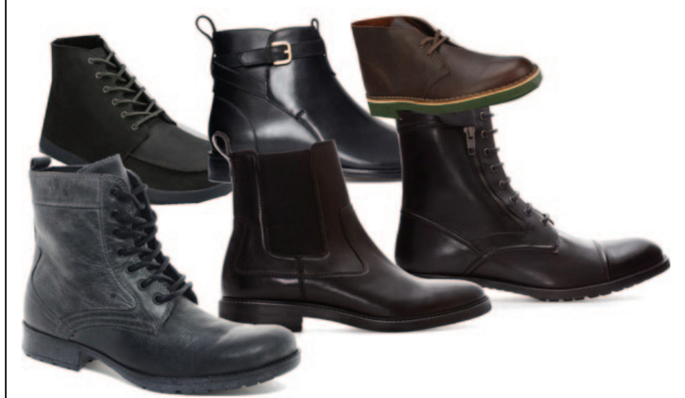
(top left to bottom left, UrbanOutfitters $120, Zara $139, UrbanOutfitters $120, Zara $159, Zara $100, Asos.com $62.28)

The idea of wearing boots for many may seem like foreign territory, since sneakers are always the obvious choice. Well this fall boots for men are everywhere and they come in different styles. They range from combat, to motorcycle, and ankle boots. All three styles can practically be worn with Joggers, Skinny, and boot cut jeans. If you want to take a break from wearing sneakers all the time try something new and buy a pair of boots.