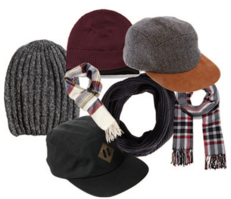
(top left to bottom left H&M$7.95, Express $29.90, Asos.com

The world of Fashion may seem like a female's playground but it would be nothing without menswear. From amazing Leather jackets to rugged combat boots, men's fashion dominated on all runways this fall. For the everyday guy that's on the go and wants to keep up with some great fashion trends here are four essential items that all men should try to incorporate into their fall attire.