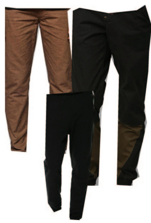
(left\ to\ right\ Urban Outfitter\ \$64\ Zara\ \$70\ Urban Outfitter\ \$59)

The idea of wearing boots for many may seem like foreign territory, since sneakers are always the obvious choice. Well this fall boots for men are everywhere and they come in different styles. They range from combat, to motorcycle, and ankle boots. All three styles can practically be worn with Joggers, Skinny, and boot cut jeans. If you want to take a break from wearing sneakers all the time try something new and buy a pair of boots.