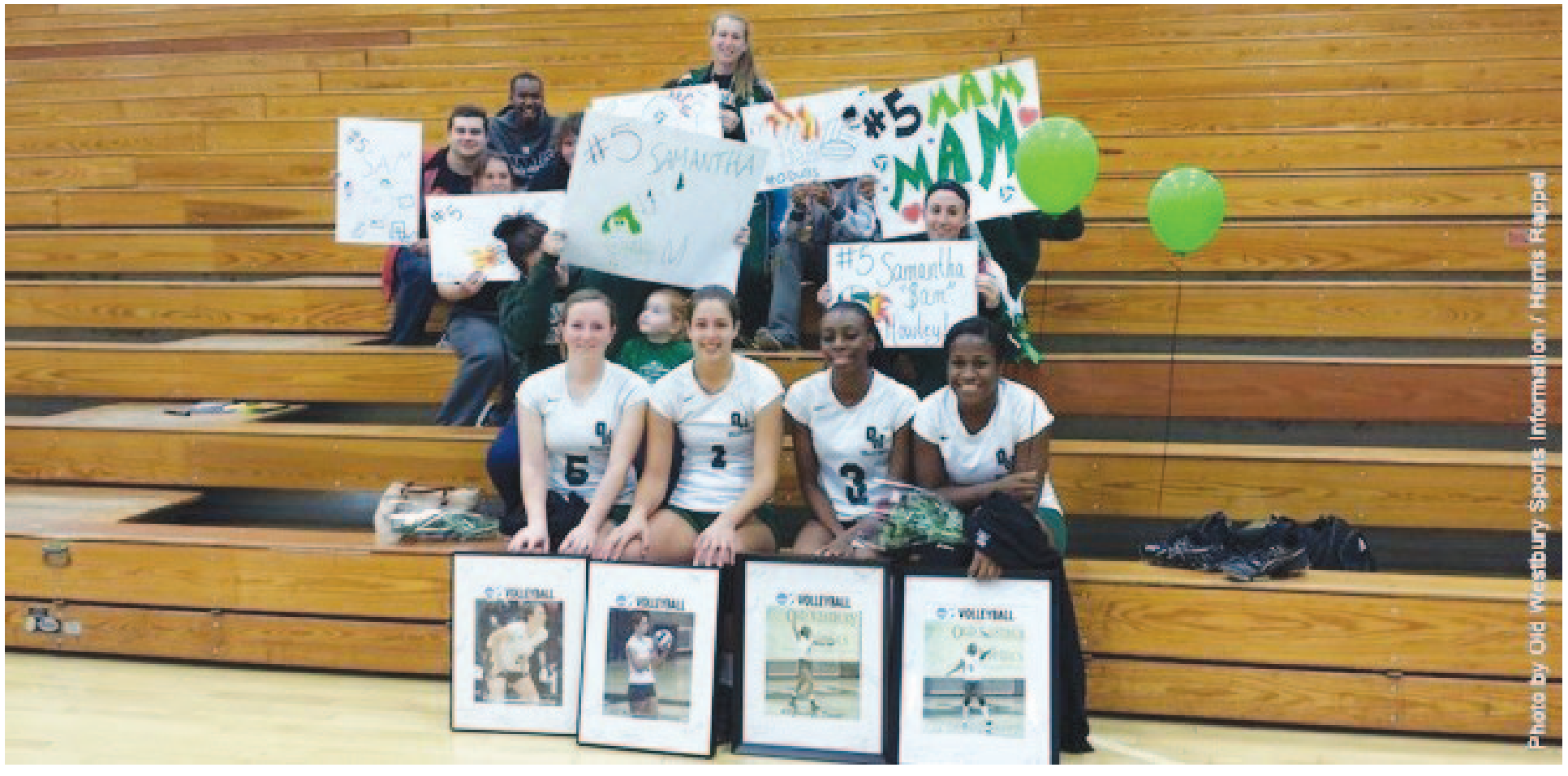
Volleyball seniors with their biggest fans after the win.

The Two Matches Were the Final Home Games of the Season