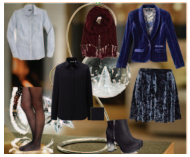
From Left Clockwise- Factory stripe button-down shirt $30 factory.jcrew.com; FOREVER 21 Favorite Cable Knit Scarf $15 forever21.com; Blue Velvet Blazer $17 kohls.com; River Island Dark grey crushed velvet skater skirt $16 riverisland. com; H&M Platform boots $48 hm.com; UNIQLO Women Stretch Long Sleeve Shirt $30 uniqlo.com; Sheer Basic Tight $12 urbanoutfitters.com

Christmas- considered by many the greatest time of the year, and if you're going to a dinner party why not bring the fun and flair for the occasion? Velvet is a fabric that screams winter time. You can create a make-shift suit with a velvet blazer jacket and skirt or leggings. A button down a big cozy knit scarf gives it a prep school look. Give the look some edge with sheer tights and chunky boots.