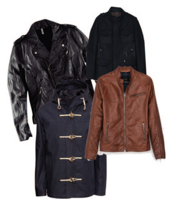
(top left to bottom left H&M $70, Zara $179, Zara $100, H&M $64)

Men's Leather and Pea coats are great for the fall. For the first half of the fall where the weather is typically warm, leather jackets are perfect for sunny fall days and cool fall nights. As the fall draws in and the temperature starts to drop pea coats are a great way to remain warm and they also work for the cold winter weather.