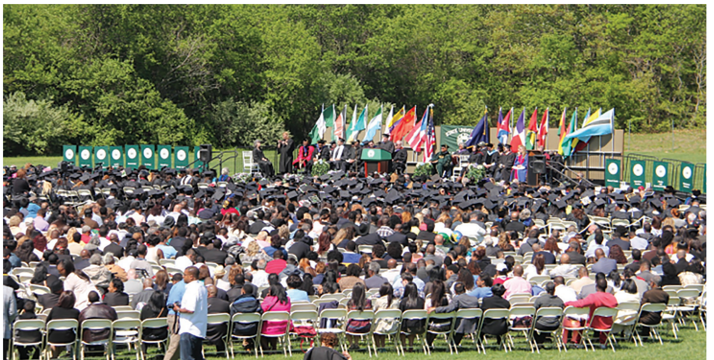
A graduation from a previous year.