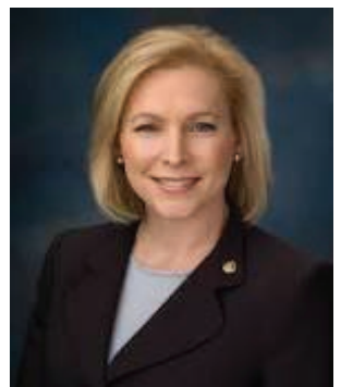
Senator Kirsten Gillibrand

Each student will receive four tickets to give to their guests. Commencement tickets will be available for pick up at no charge on Wednesday, May 6 (11 a.m. -5 p.m.) and Thursday, May 7 (11 a.m. -7 p.m.), during the "Commencement Celebration" where students whose graduation applications have been accepted may purchase and/or pick up their caps and gowns in the Student Union. Graduates/candidates must purchase a cap and gown to obtain tickets.