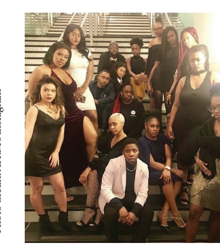
All the Right Moves(ATRM)