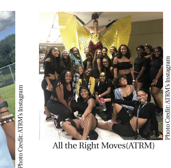
All the Right Moves(ATRM)