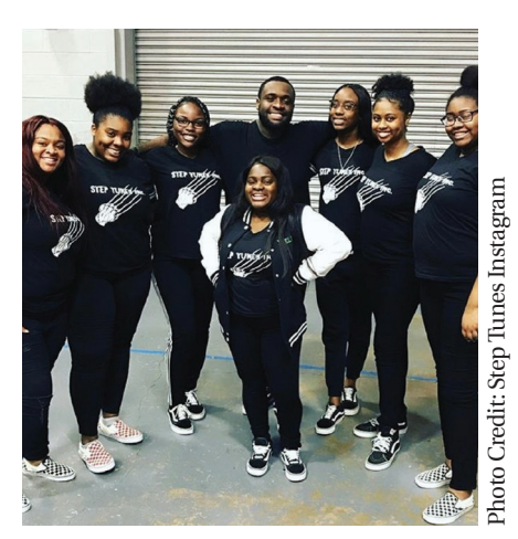
Step Tunes Inc