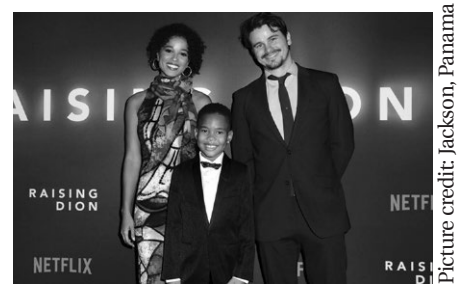
Very Smart Brothas

In October, Netflix premiered a brand new original series titled "Raising Dion." Raising Dion is a nine episode